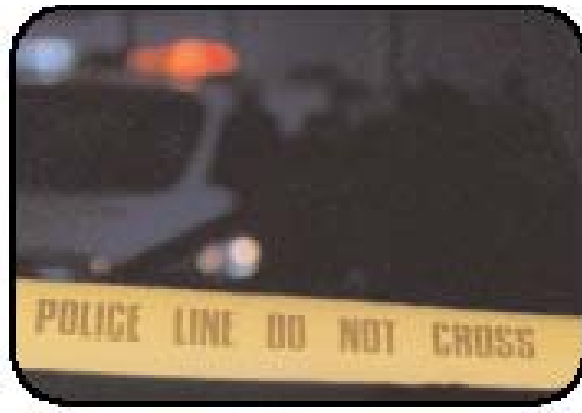
Moving footage of police car and crime scene

ANNCR And now ninety-five percent of outstanding homicide warrants in LA are for illegal aliens.