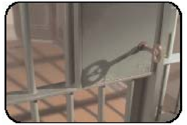
Moving footage of jail closing

ANNCR Two-thirds of felony assault warrants are for illegal aliens.