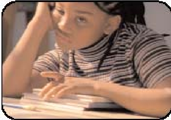
Moving footage of left-behind student

ANNCR California spends 2.2 billion dollars a year on education for illegal aliens and all we get are dysfunctional classrooms.