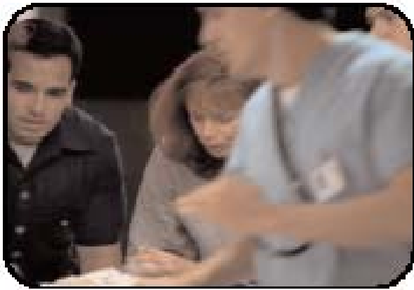
Pan stills of waiting room

ANNCR LA taxpayers pay 350 million dollars a year for illegal aliens' unpaid medical bills.